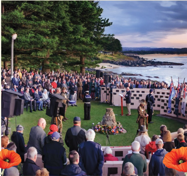
2023 Anzac Day Dawn Service - Turross Head

All branches of Richmond Tweed Regional Library will be closed for the ANZAC Day public holiday on Thursday 25 April