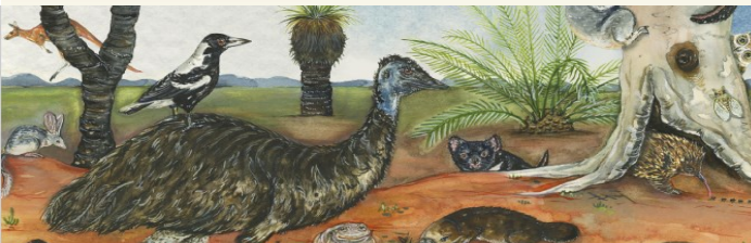
NSW Department of Education

Richmond Tweed Regional Library Connect. Discover. Escape.